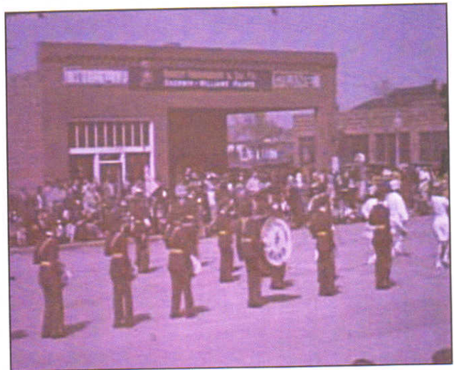
10th Anniversary Marshall Band Festival. April 5th, 1947