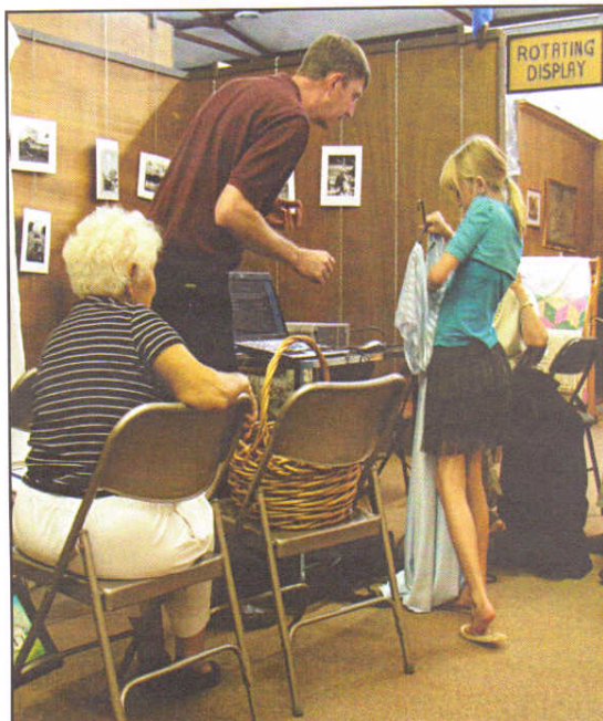
Family Treasures at the Frontier Country Museum, in Crescent.