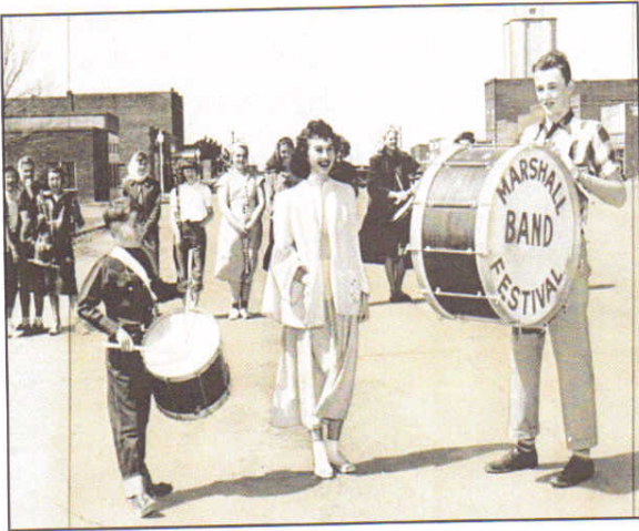
The 13th Annual Biggest Little Band Festival, March 27th, 1950

Marshall to compete. In 1952, the competition had to be cancelled due to a state competition date conflict. This was a fatal blow for Marshall, ending of the Marching Band Competition for which the town had become famous.