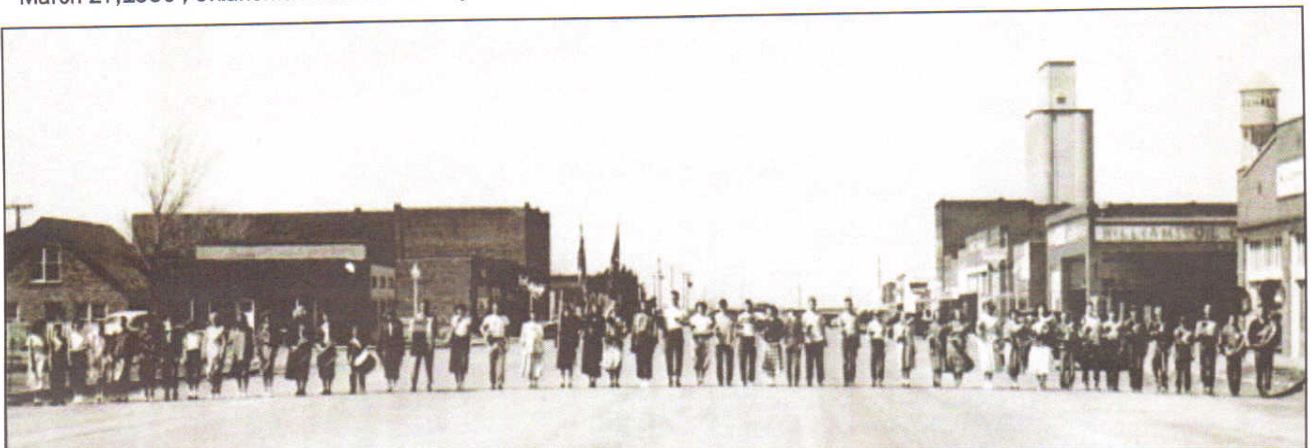
50 Marshall band members on Main Street 97 feet wide March 27, 1950 , Oklahoma Historical Society