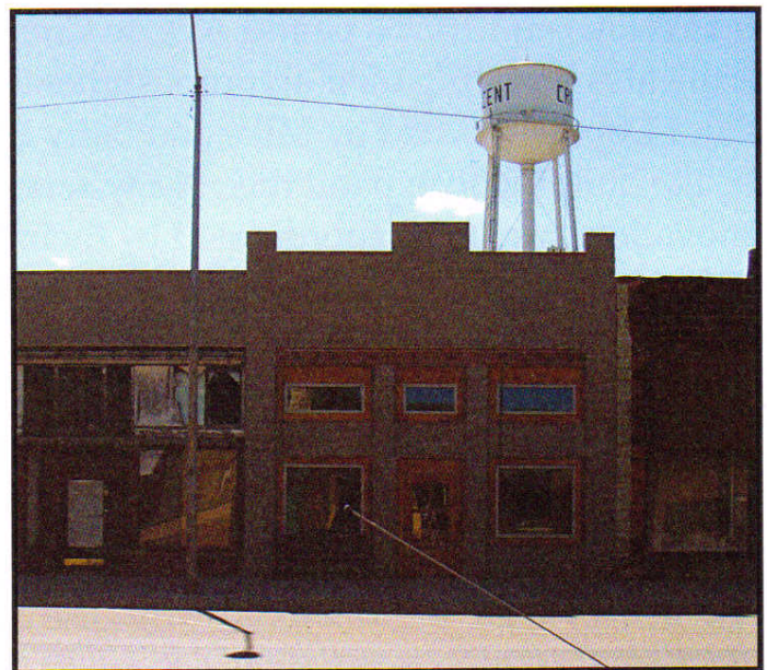
107 N. Grand Avenue Crescent