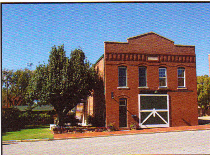
Cammack Livery Stable, 215 S. 2nd Guthrie