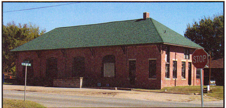
Rock Island Depot, S. Division Guthrie